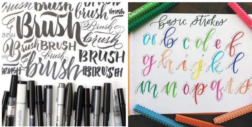
Brush Calligraphy: Mondays, October 14 and 21, 6:30-8:00 p.m.