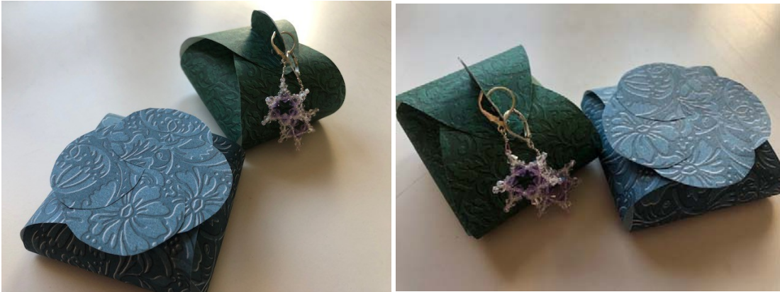
Snowflake Earrings & Gift Boxes: Monday, December 2, 6:30-8:30 p.m.