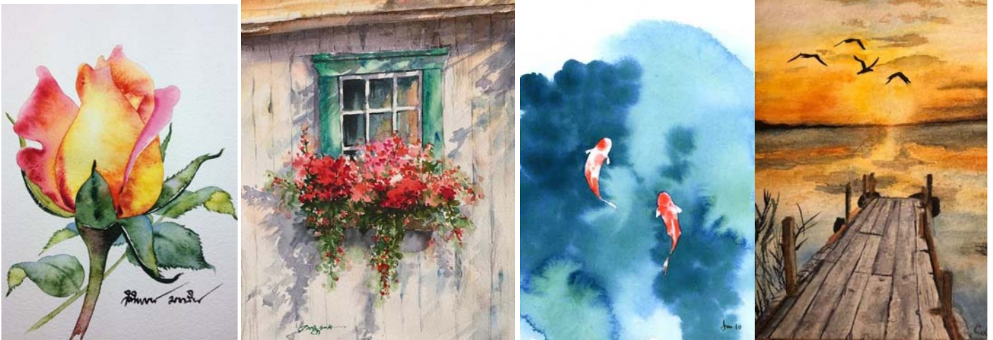
Watercolor: Mondays, September 16-30, 6:30-8:00 p.m.