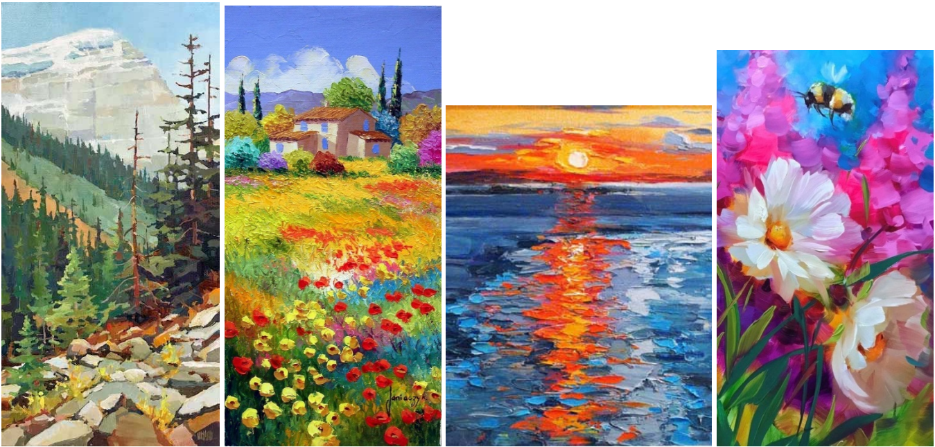
Acrylic Painting (A Blank Canvas...A Stroke of Genius): Mondays, November 11-25, 6:30-8:00 p.m.